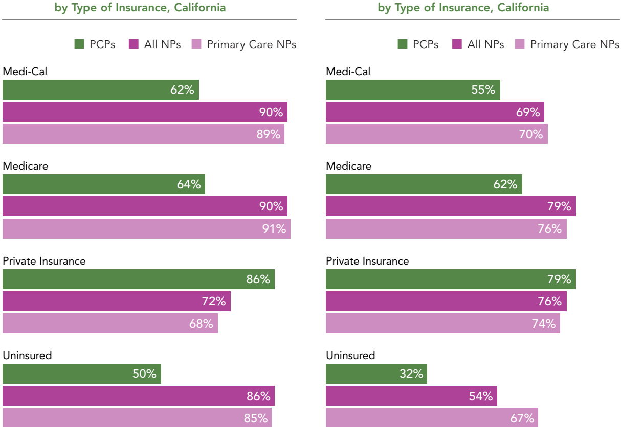
Figure 2. Clinicians with Any Patients in the Practice, by Type of Insurance, California