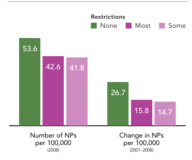
Source: P. B. Reagan and P. J. Salsberry, "The Effects of State-Level Scope-of-Practice Regulations on the Number and Growth of Nurse Practitioners," Nursing Outlook 6, no. 1 (2013): 392–99.

Notes: PCP is primary care physician and represents 2015 data. NP is nurse practitioner and represents 2017 data.