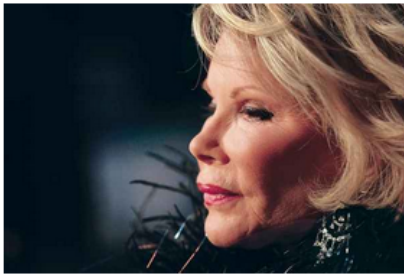
Joan Rivers, who was reportedly undergoing an endoscopy, went into cardiac arrest at an ambulatory surgery center in New York and died several days later.