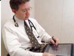
Physician at point-of-care