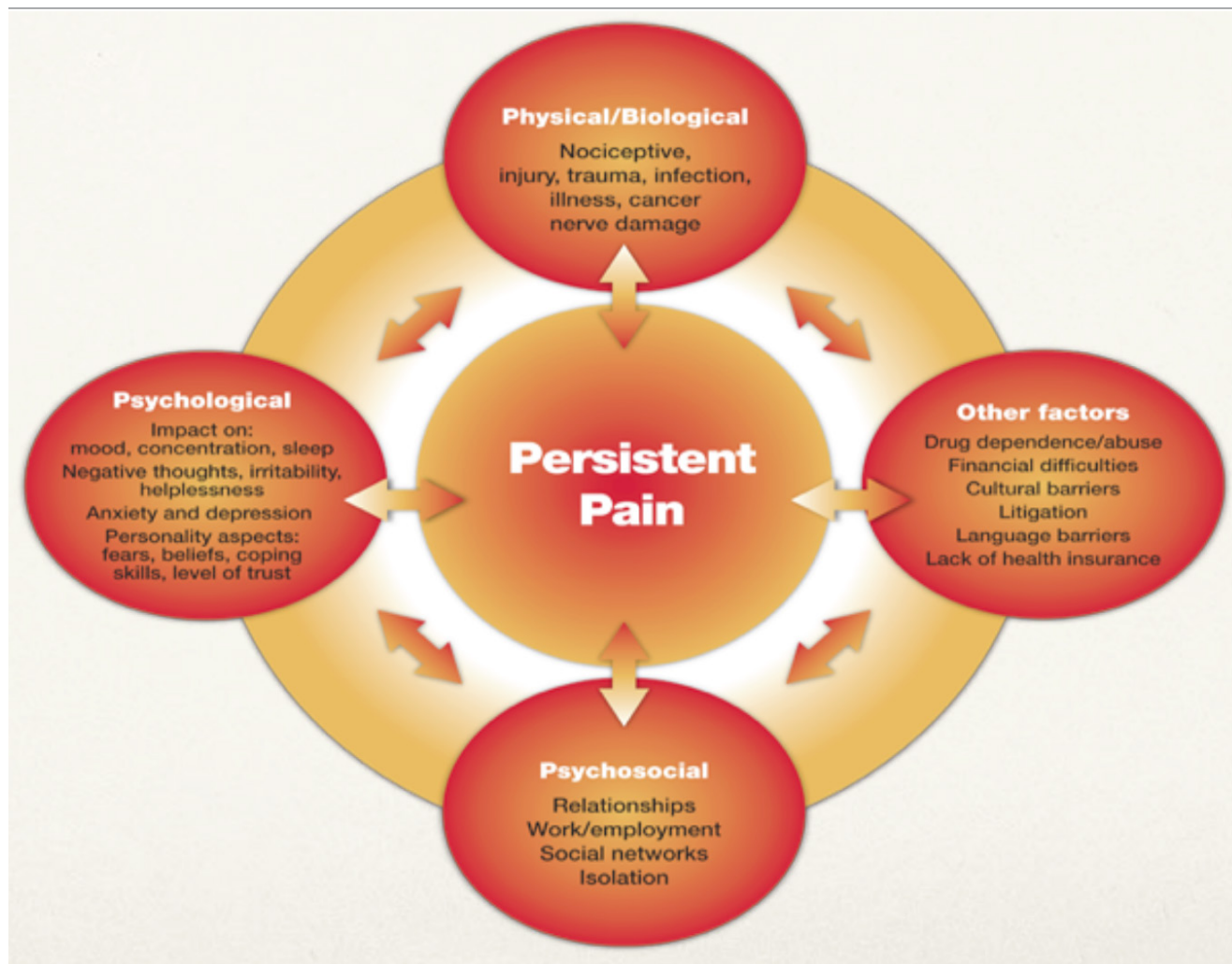
Figure 1. Biopsychosocial Model of Pain

Notes: Nociception is the sensory nervous system's response to intense chemical, mechanical, or thermal stimulation. Nociception triggers physiological and behavioral responses and may result in a subjective experience of pain.